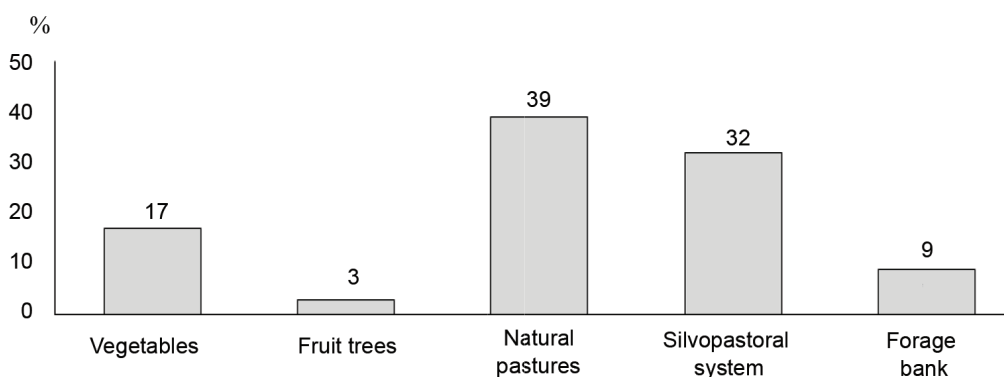
Figure 1. Soil distribution, according to its use.

turn, the farm has three subsystem, which correspond to temporary crops (vegetables), permanent crops (fruit trees, feed for cattle) and animals.